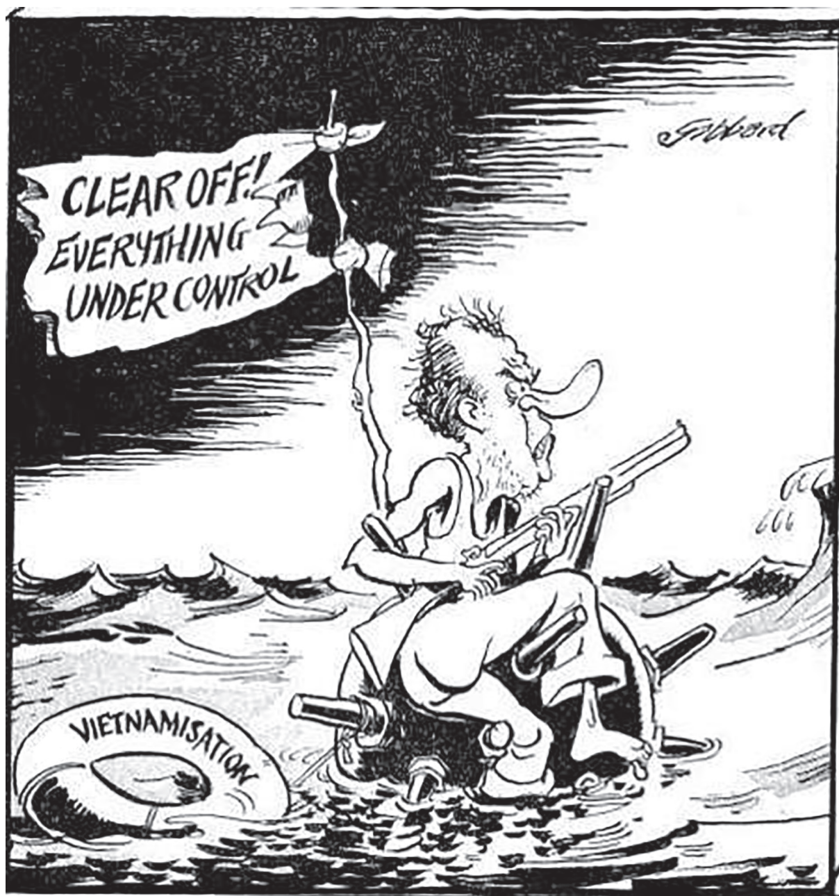
A cartoon published in a British newspaper, 1971. It shows Nixon sitting on a floating bomb.