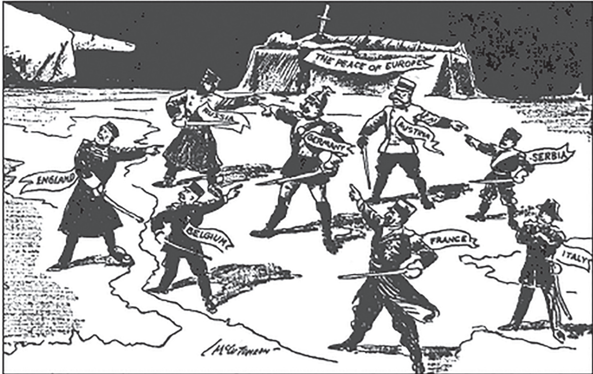
A cartoon published in an American newspaper, 5 August 1914.