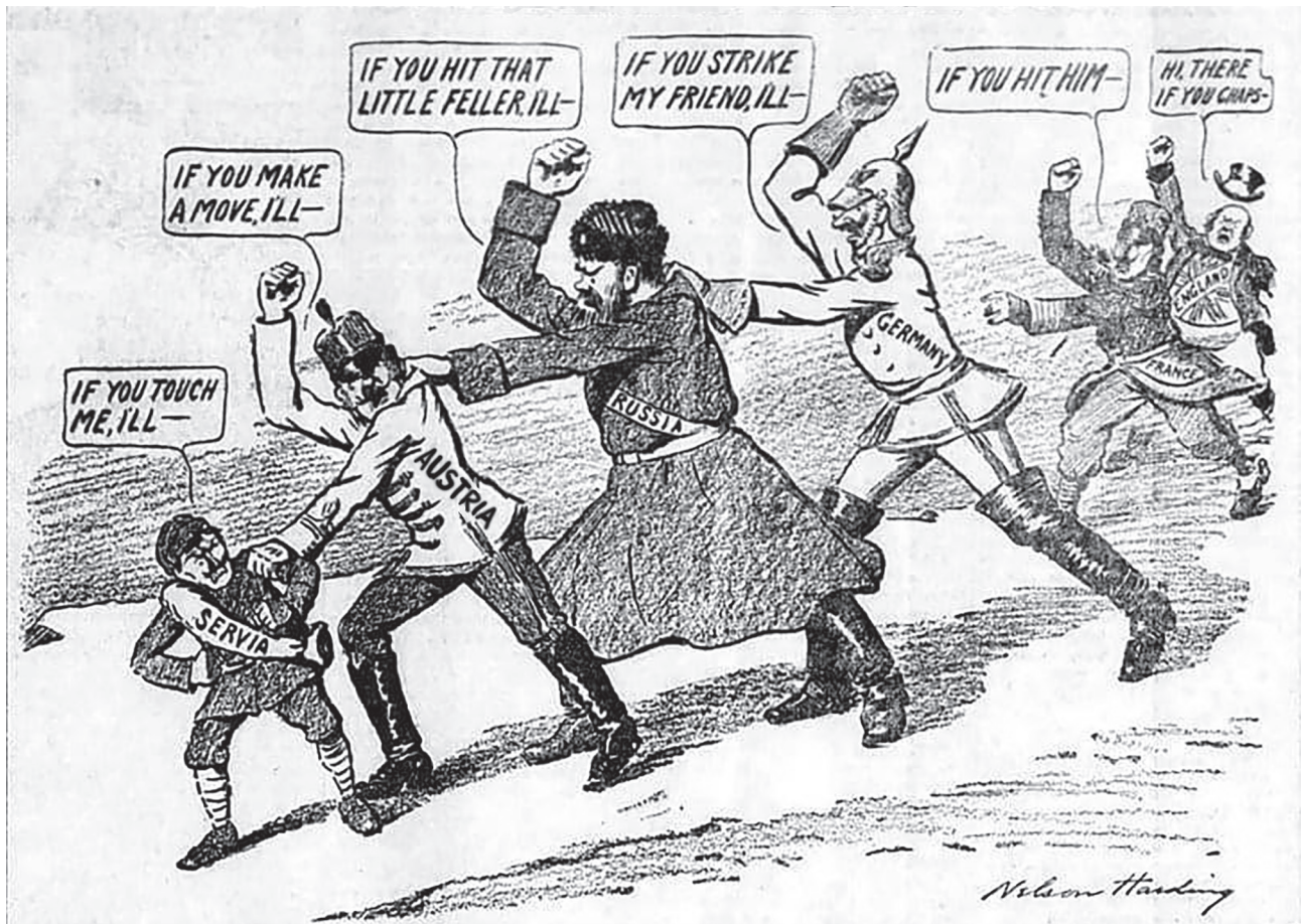
A cartoon published in an American newspaper with the title 'The Chain of Friendship', July 1914.