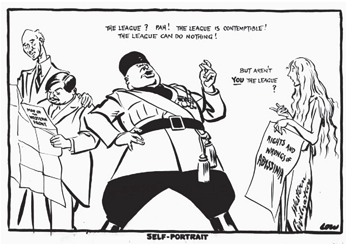
A cartoon published in Britain in February 1935. The figures on the left represent Britain and France.