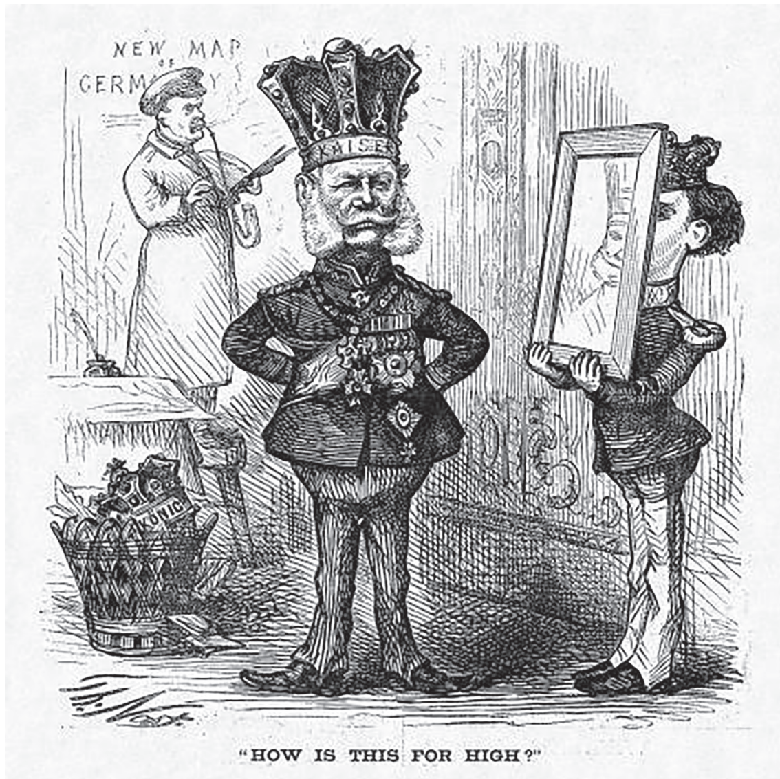
A cartoon published in an American magazine, 7 January 1871. Bismarck is in the background. William's Prussian crown lies in the waste bin.