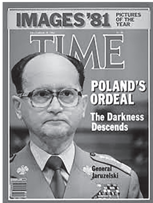
The front cover of the American 'Time' magazine, 28 December 1981.