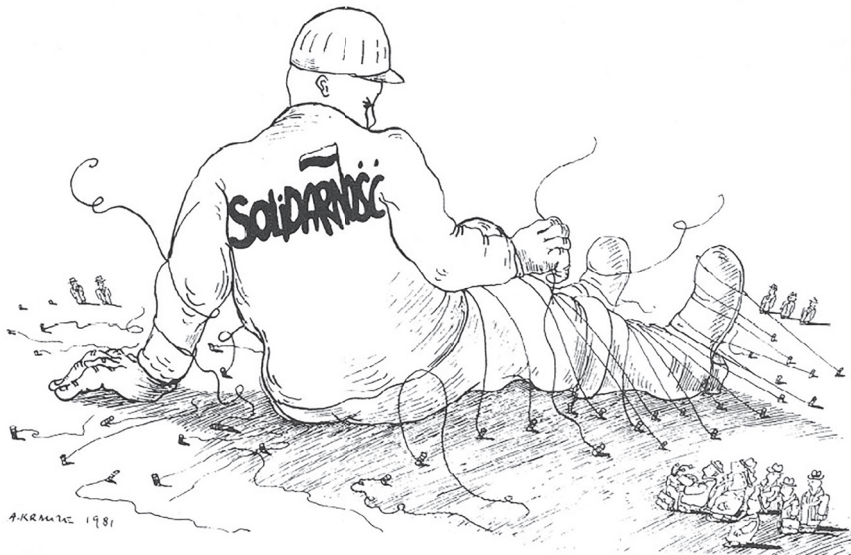
A cartoon published in Poland. It was published immediately after the imposition of martial law in December 1981.