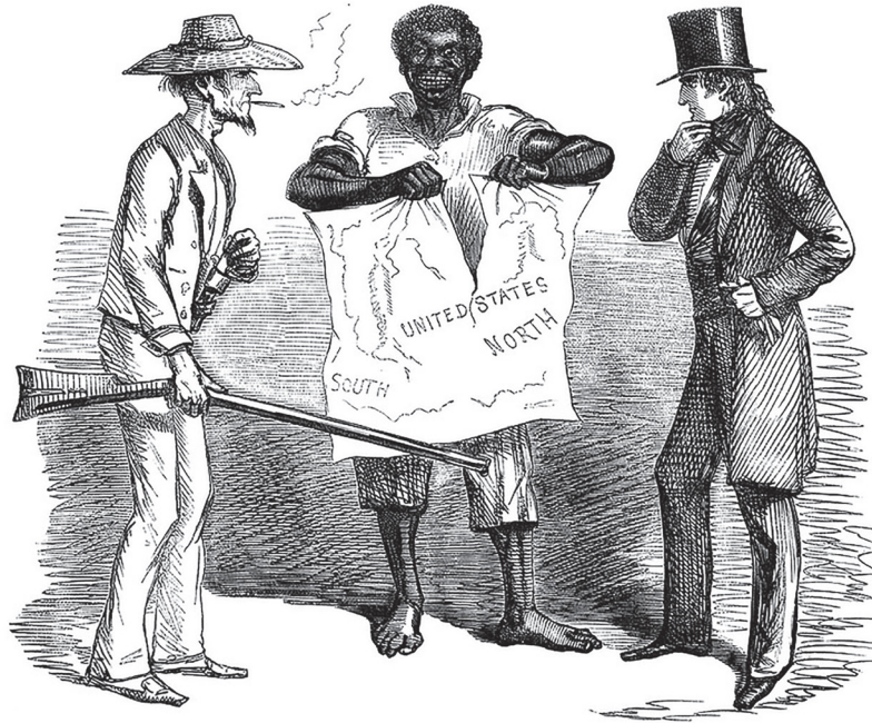
THE DIS-UNITED STATES—A BLACK BUSINESS.

A cartoon published in a British magazine, November 1856.