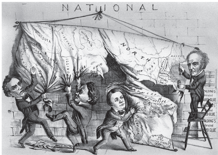
A cartoon published during the 1860 presidential election campaign. The candidates are (left to right) Lincoln, Douglas, Breckinridge and Bell. Bell is applying glue from a very small pot.